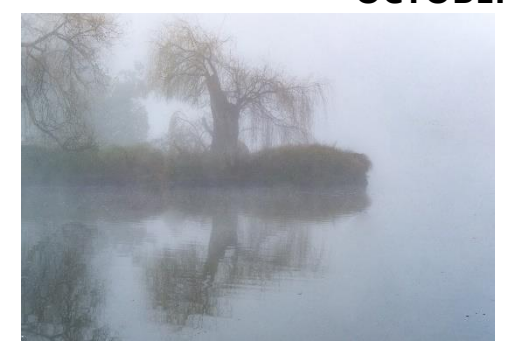
Category 17 WINTER - COLD Foggy Morning by Ruth Boere