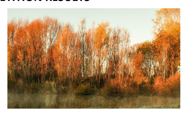
Category 18 TREES Autumn by Ruth Boere